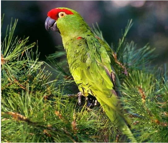
Thick billed parrot Rhynchopsitta pachyrhyncha