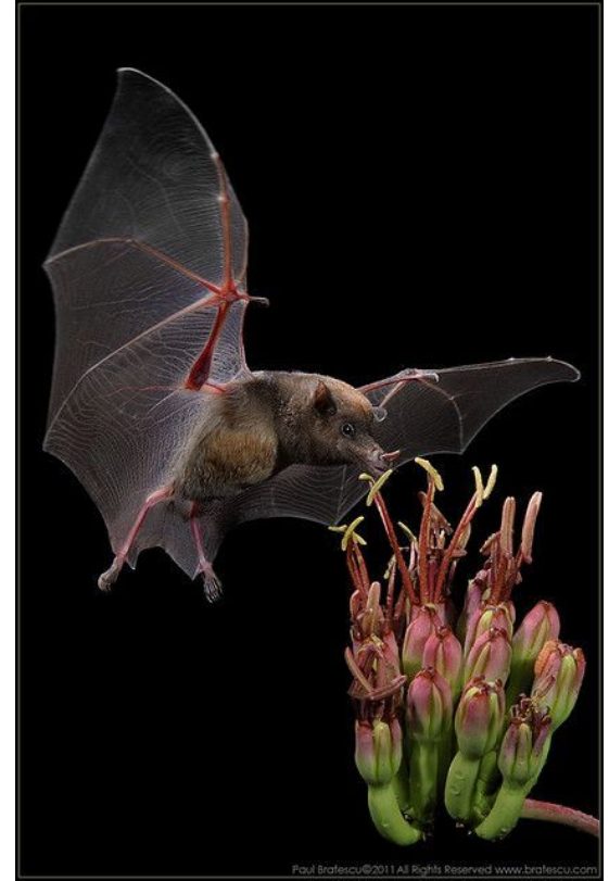
Greater long-nosed bat Leptonycteris nivalis