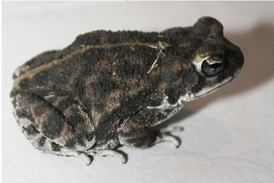
Confusing toad Incilius perplexus