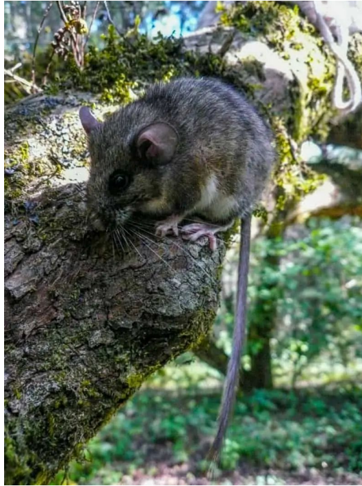
Goldman's woodrat Nelsonia goldmani